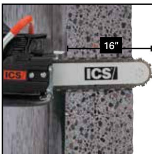
Deep cutting solution for obstructed or small openings