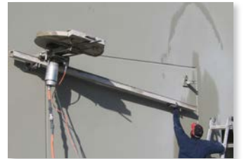
Versatile track system