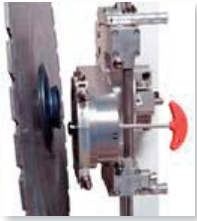
Quick disconnect coupling for blade