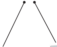
Durable, heavy duty connectors